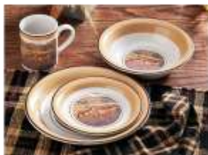
Similar item as show

Perfect addition to any outdoor-themed dining area. Brilliant with color and design, this heavy-duty stoneware is nice enough to display, yet sturdy enough for everyday use. The entire 12-Piece Dinnerware Set is microwave- and dishwasher-safe. Set includes four 10-1/2" dinner plates, four 7-1/2" salad plates and four 24-oz. bowls. Mug not included.